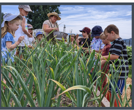
Top: Palestinian children plant marigolds in Manjala's educational program in the West Bank Bottom : Plumas County children learn about harvesting garlic on Rugged Roots farm